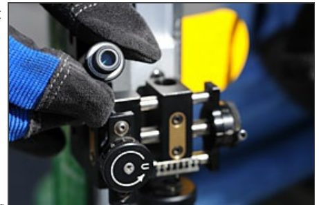
The MicroSight's wafer-thin optical element is only about a quarter-inch in diameter.

Idaho National Laboratory's innovative gunsight technology, the MicroSight, helps the eye solve this problem. The MicroSight, a disc smaller than a dime, brings both the target and the iron sight into simultaneous focus, giving marksmen a better sight picture. The new sight has national-security applications, as it could improve safety and performance for American soldiers. Millions of target shooters and hunters should also benefit.