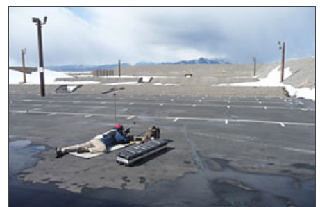
INL engineer David Crandall, a highly

"Competitive shooters are always looking for an edge, for something better," Crandall says. "You